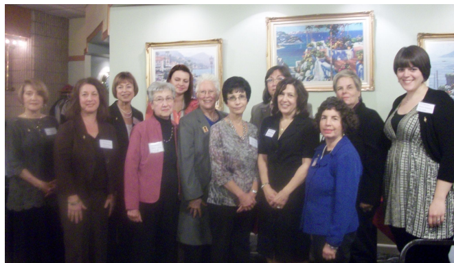
Zeta's initiates (l. to r.)