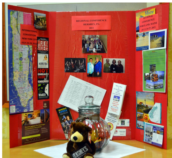
Display from 2011 Northeast Regional Conference in Hershey, PA