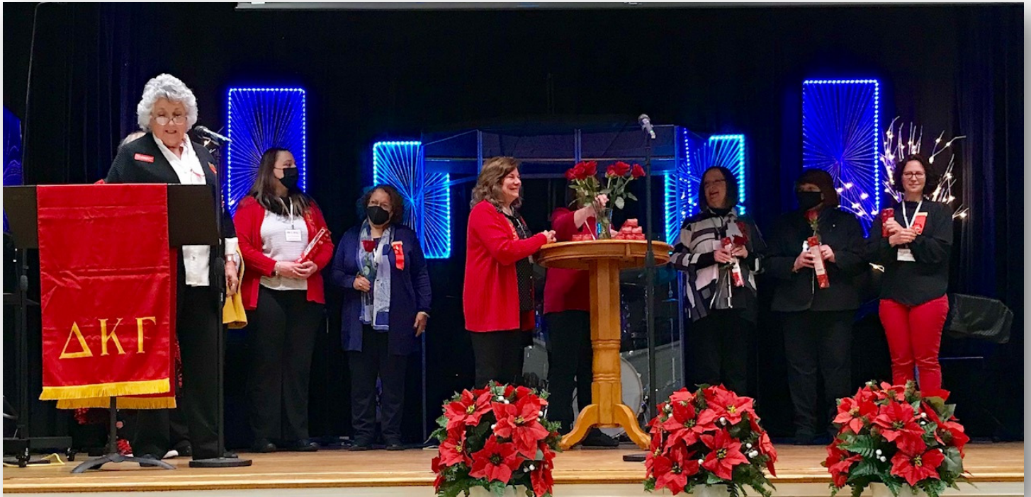
Alpha Kappa Member Representatives to the District I Meeting in Port St. Joe