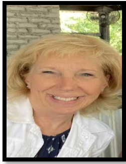
Lane Mathews RT: Leon County Schools