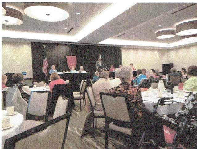
Holding the general meeting at conference.