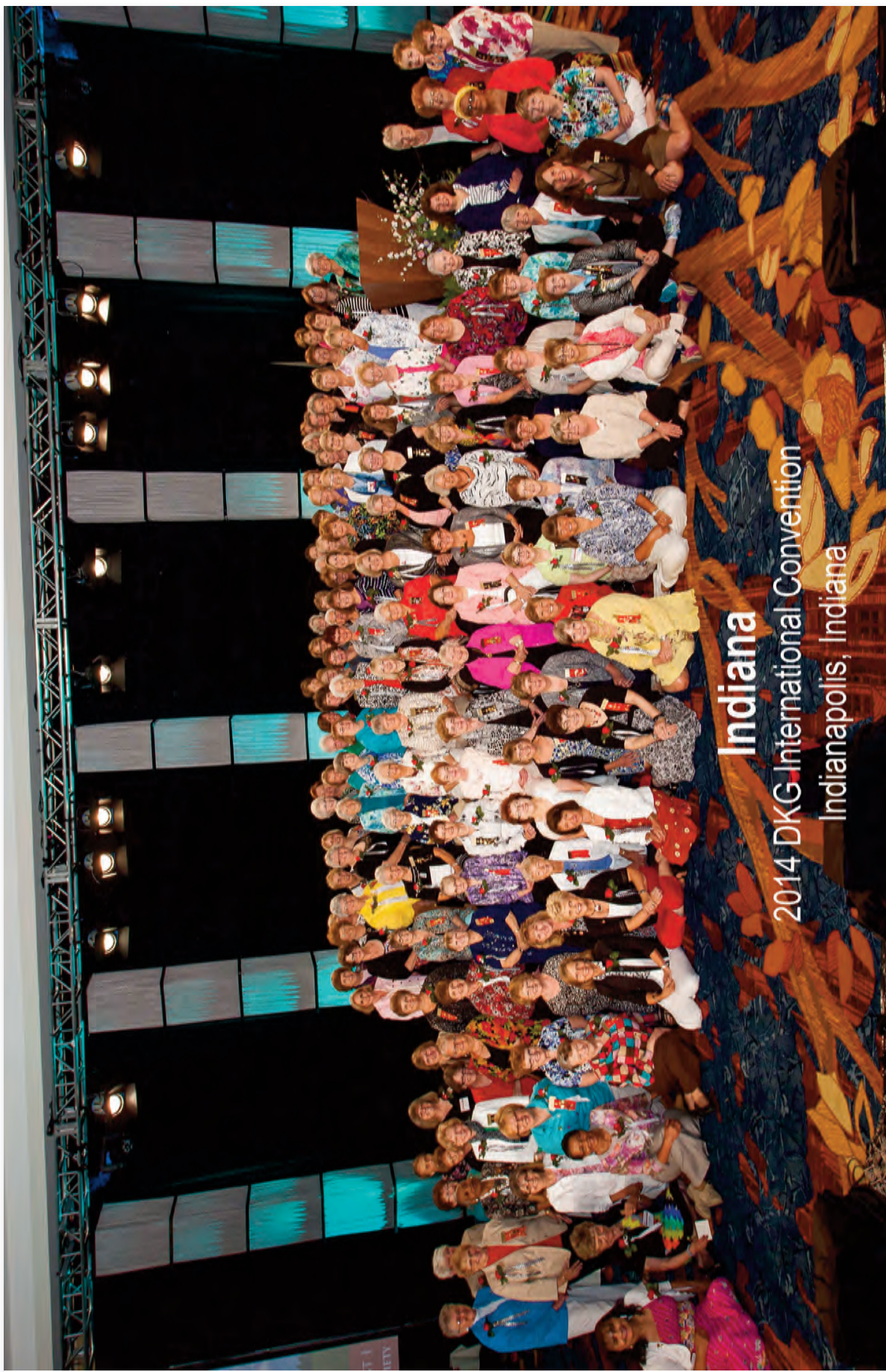
Gathering ALL of the Indiana members present at the Convention was no small task! Shown is everyone who was present immediately following the Celebration Luncheon. Indiana had more than 250 volunteers who played a vital part in making the Convention go smoothly.