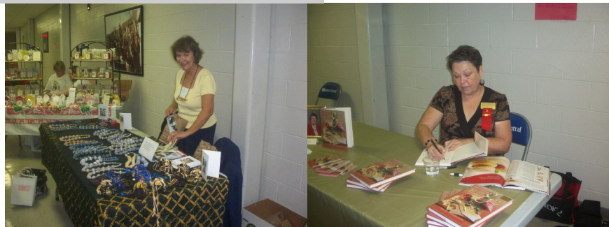
Mu Chapter members who were vendors at the 2012 Fall Workshop.