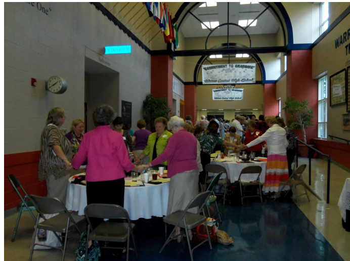
Alpha Gamma Sisters sing the Delta Kappa Gamma Song at the conclusion of the lovely luncheon in Bowling Green and held at Warren Central High School. Thanks to Dealt and Alpha Epsilon Chapters for hosting the Fall Workshop held on September 7 and 8, 2012.