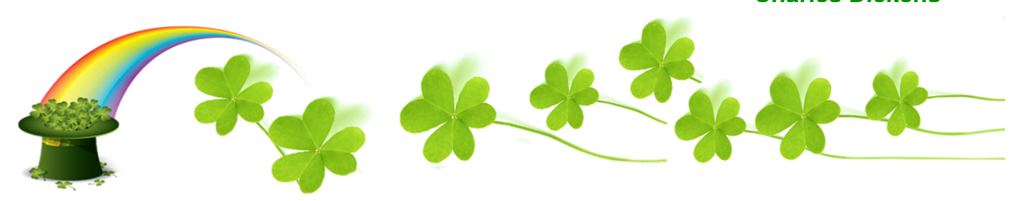
Page 5 of 7 — DELTA KAPPA GAMMA — ALPHA IOTA STATE — MARCH, 2012 / VOL. ONE / ISSUE SEVEN