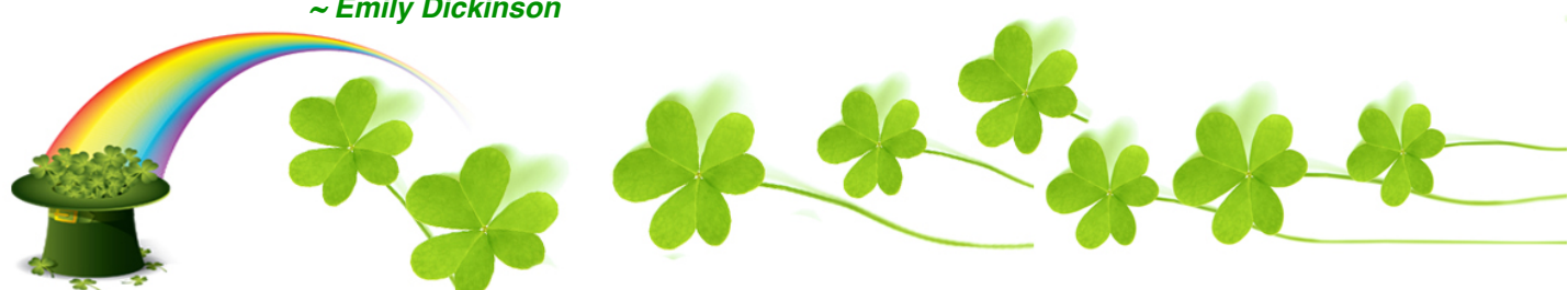
Page 4 of 7 — DELTA KAPPA GAMMA — ALPHA IOTA STATE — MARCH, 2012 / VOL. ONE / ISSUE SEVEN

We are very fortunate to be a Society of "Key Women Educators" with a vast array of talents. Begin thinking, talking and encouraging the idea of becoming a leader in our Society.