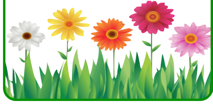
Page 7 of 7 — DELTA KAPPA GAMMA — ALPHA IOTA STATE — MARCH, 2012 / VOL. ONE / ISSUE SEVEN