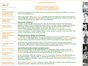
Women in Leadership www.guide2womenleaders.com