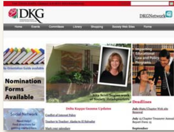
DKG - Home Website www.dkg.org