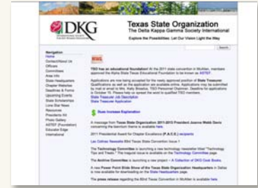
DKG - Alpha State - Texas www.alphastatetexas.org