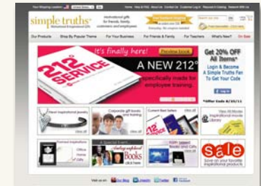
Simple Truths - Motivational Gifts www.simpletruths.com