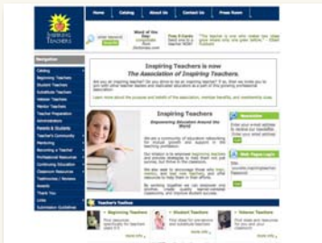
Inspiring Teachers www.inspiringteachers.com