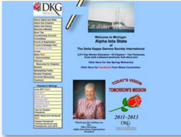
DKG - Alpha Iota State www.deltakappagamma.org/MI