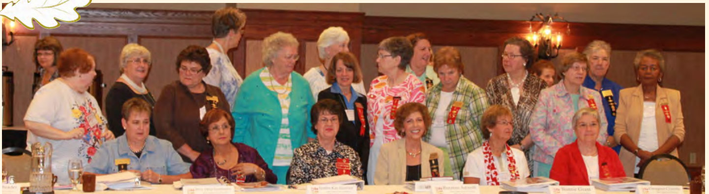
Northeast Regional State Presidents at our training.