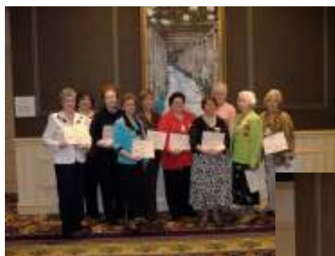
Numeracy/Literacy Project Awards