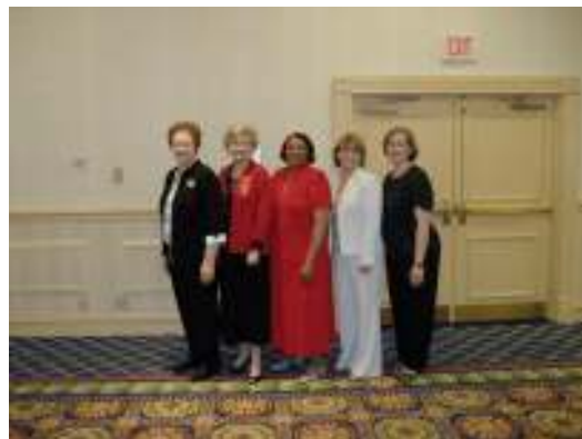
2007-2009 District Officers