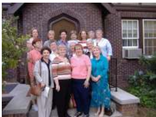
Home, Hearth Tour