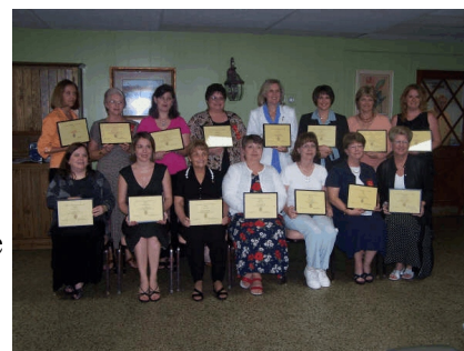
Leadership Management Seminar 2007