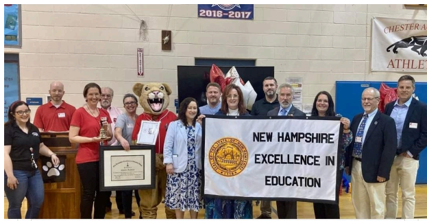
Congratulations to the NH Edies 2023 K-8 School of Excellence Chester Academy! 🎉👏

The 2023 EDies Awards was held June 3, 2023 at DoubleTree by Hilton Manchester Downtown. Chester Academy was proud to accept the 2023 K-8 School of Excellence Award.