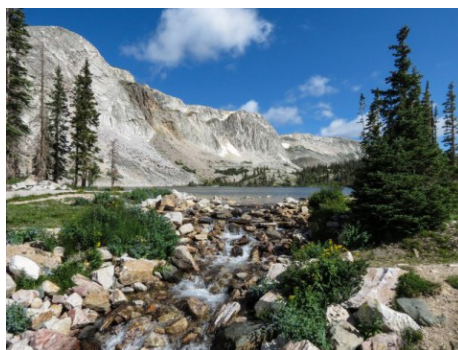
The Snowy Range and Marie Lake