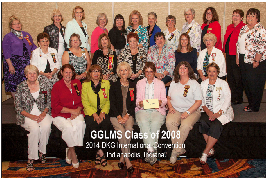
GGLMS Class of 2008 2014 DKG International Convention Indianapolis, Indiana