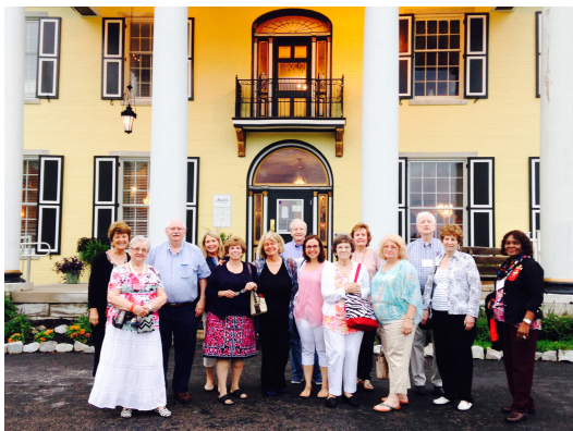
Chapter members got together for dinner at "Monel's at the Manor" during the DKG International Convention in Nashville, this past July.