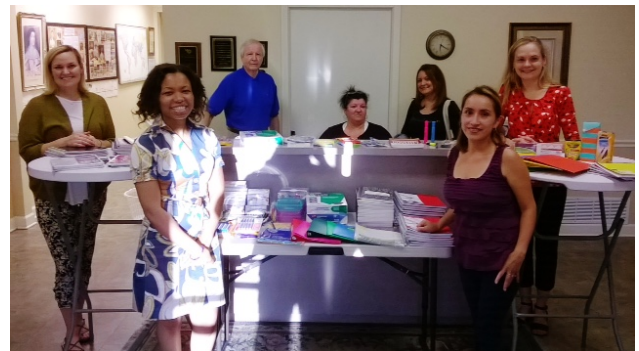
Adult students at DeNeuville Learning Center with donated school supplies (pictured above and below.)