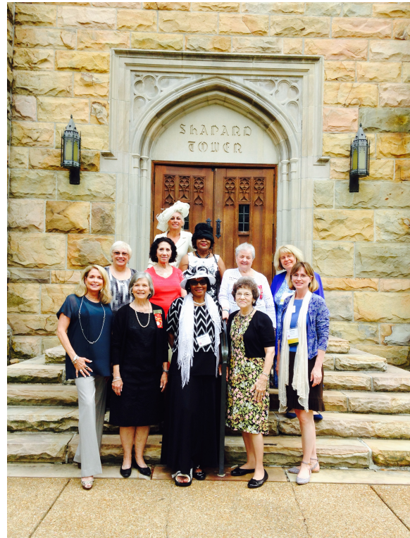
Alpha Lambda members at Sewanee, following the Xi State Ceremony of Remembrance