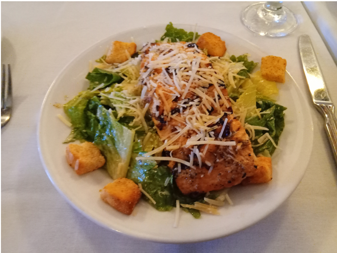
And here's what you missed if you didn't go to the March meeting.