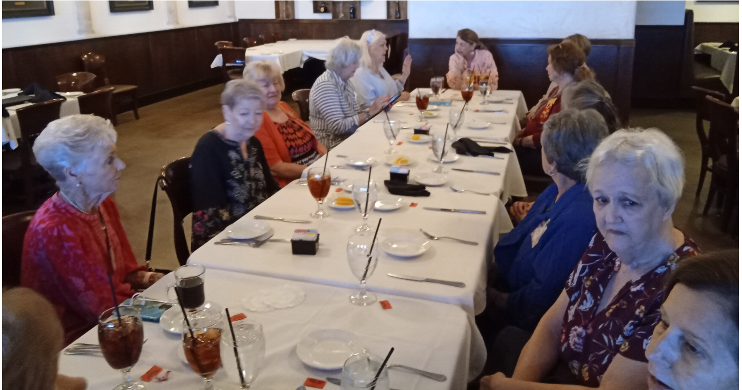
Table shots from lunch at Scuzzi's March meeting