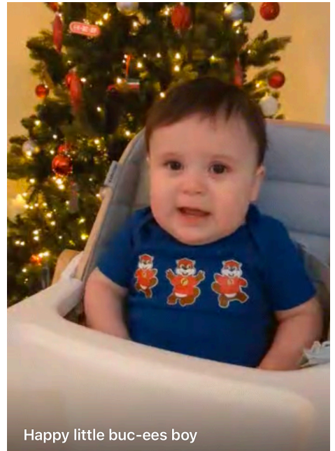
Happy little buc-ees boy