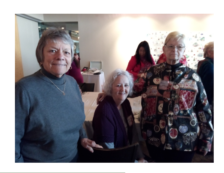
Check out Beta Tau's Website http://deltakappagamma.org/TX-betatau/