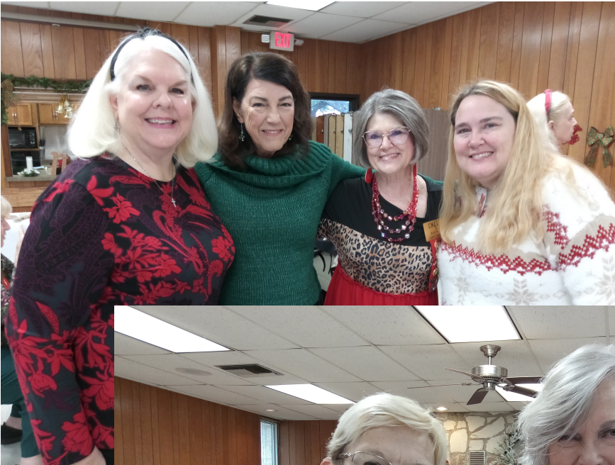
Good times at the December meeting!

Regularly clean up and optimize your device's storage by uninstalling unused apps, deleting old files and clearing cache and temporary data. This can improve your device's performance and help you avoid storage-related issues. Also, regularly backing up important data to a secure location can prevent data loss due to hardware failure, theft or accidental deletion.