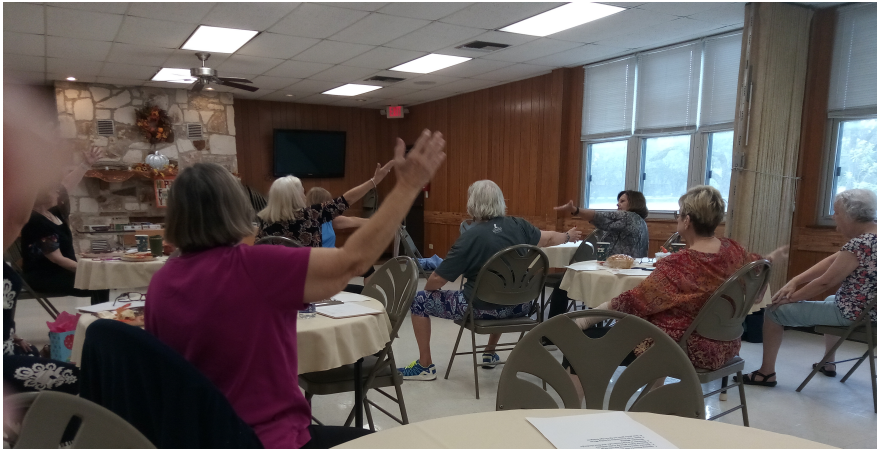
Participating in chair yoga.