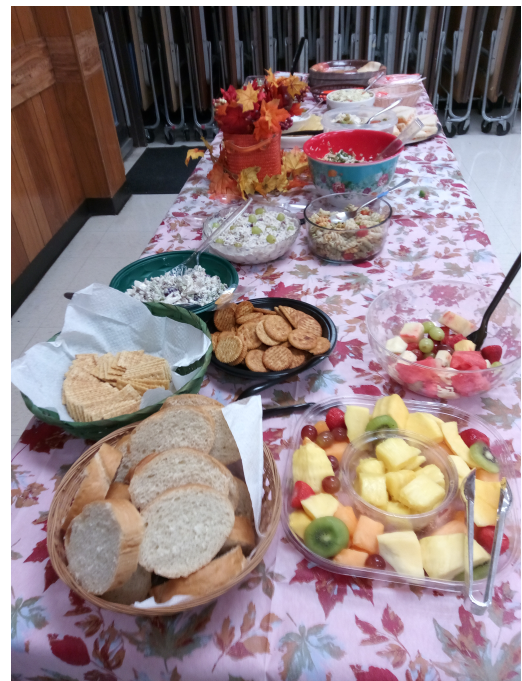
Members provided a wonderful array of tasty food for our luncheon.