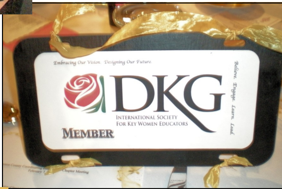
Cute party favors were given out to all attendees!