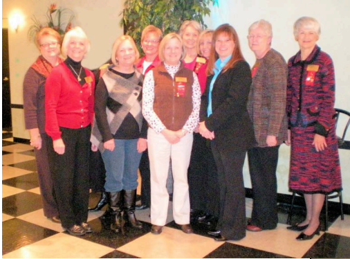
Kappa Theta members had a great time at the Tri-Chapter meeting and dinner!