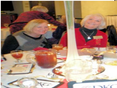
Kappa Theta member enjoyed a wonderful dinner, speaker, entertainment, and fellowship!