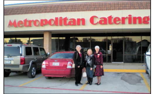
Metropolitan Catering was the site of the Tri-Chapter meeting.