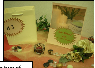
Displays showing two of the fabulous raffle prizes for the Grants-in-Aid scholarship.