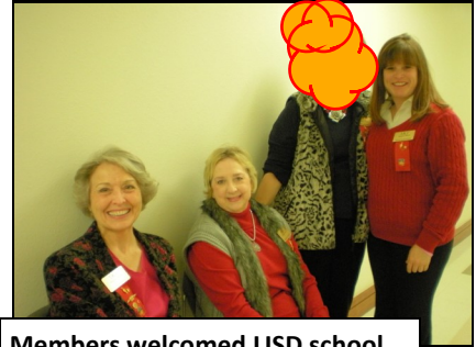
Members welcomed LISD school board members, administrators, and retired teachers.