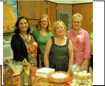
October hostesses show off their fabulous refreshments!