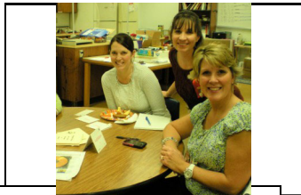
Happy members enjoy each others' company before the meeting!